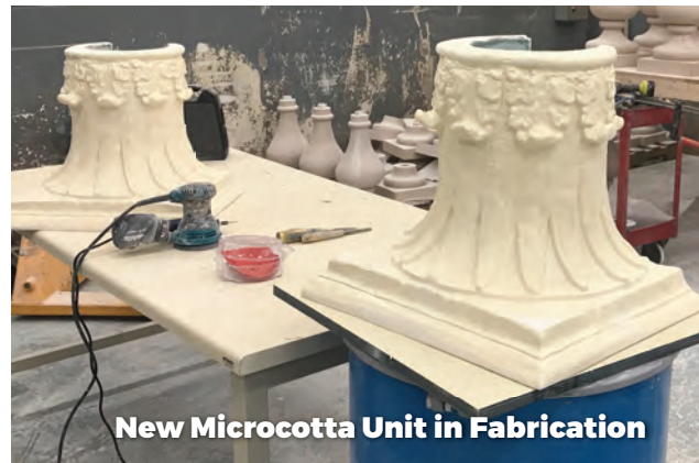
New Microcotta Unit in Fabrication