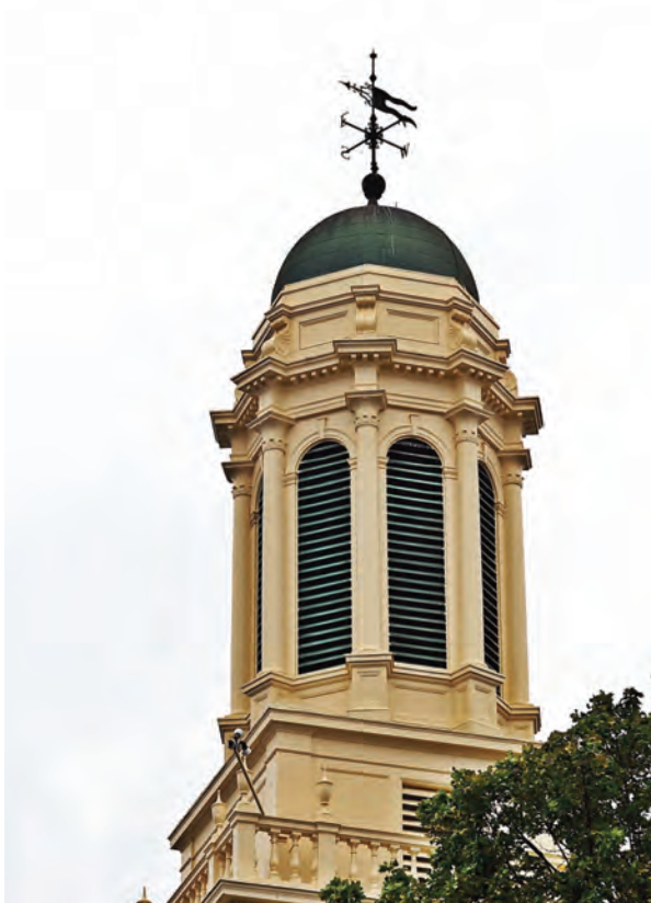
Completed Cupola